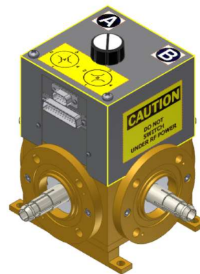
Model 61103, 4 Port 1-5/8EIA Shown

MCI Coaxial Transfer Switches are designed primarily for application in TV, AM, FM, UHF and other broadcast related areas. As four-port transfer switches, they will switch two signal sources between loads. Since they can also be used as SPDT switches, complex-switching matrices can easily be assembled.